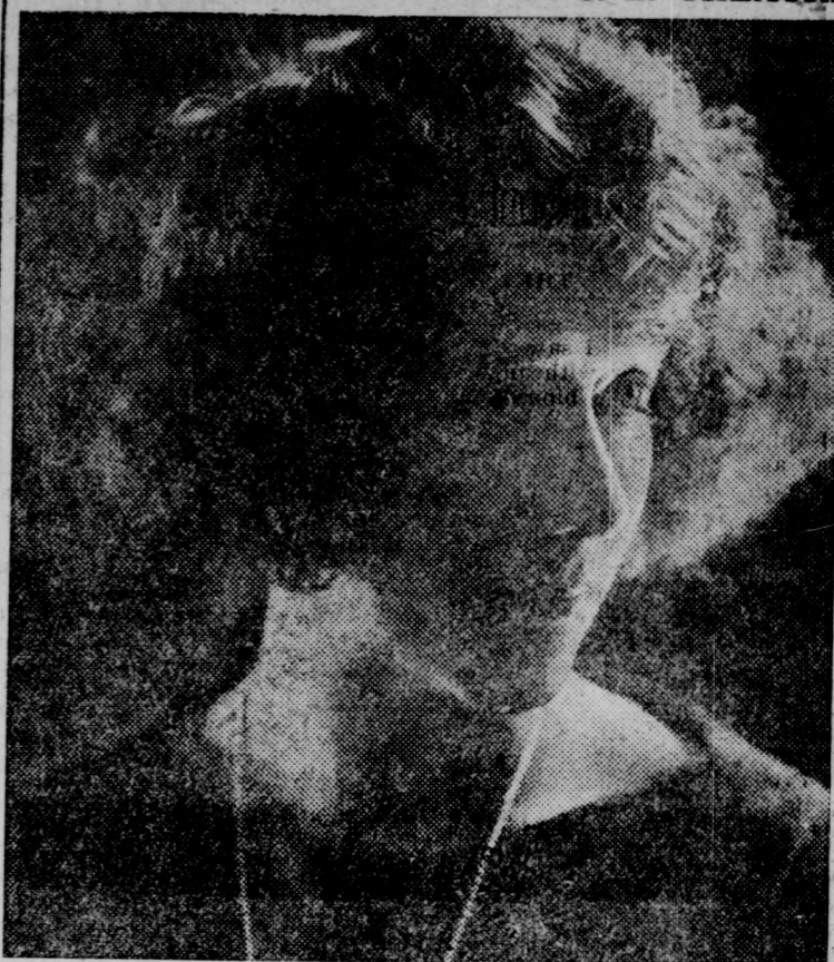
Edna Wallace Hopper, comedy star of the speaking stage and former wife of DeWolf Hopper... Miss Hopper has been so successful in her nation-wide tour...

EDNA WALLACE HOPPER TO APPEAR TOMORROW AT T. D. & L. THEATRE